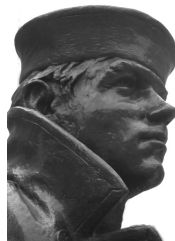
The iconic Lone Sailor statue at the U.S. Navy Memorial

Show this brochure to your veteran at the interview. All of the vets you interview will be grateful and pleased to comply. We truly need your help in this endeavor. Show them how their Navy Log entry will appear and they will be glad to share their history.